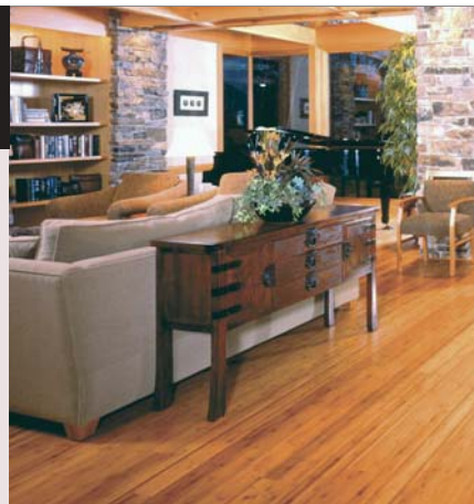
Exquisite site-finished flat grain "caramelized" bamboo flooring.

One very appealing advantage bamboo flooring offers is that it is produced from an environmentally sustainable and rapidly renewable resource. Hardwood trees require 40 to 60 years to grow.