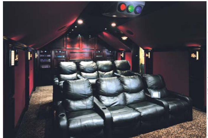
The same home theater, viewed from the opposite direction, showing the ceiling mounted projector and the wall of equipment in back.

The screen may be covered by drapery, which opens automatically when the lights are dimmed, as in a traditional movie theater. In other home theaters the screen may remain exposed, or it can be recessed into the ceiling and dropped