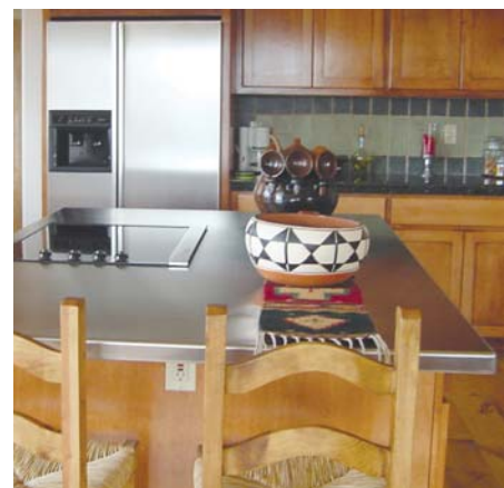
Stainless steel and wood make a great combination.

Copper is also entering the scene as a trendy choice for countertops in residential kitchens today. When the copper countertop is first polished and set in place, it will be a lustrous orange-gold color. Over